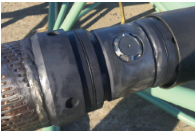
AICD completion before deployment in heavy oil well

The operator requested a fit-for-purpose completion to be developed that would be economical in this challenging heavy oil environment. The goal was to reduce water production and increase oil rates with an AICD completion system for both new wells and retrofits.