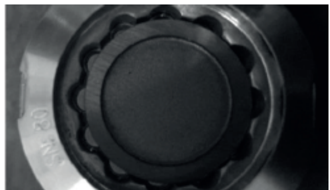
Free-floating 'non levitating' disc